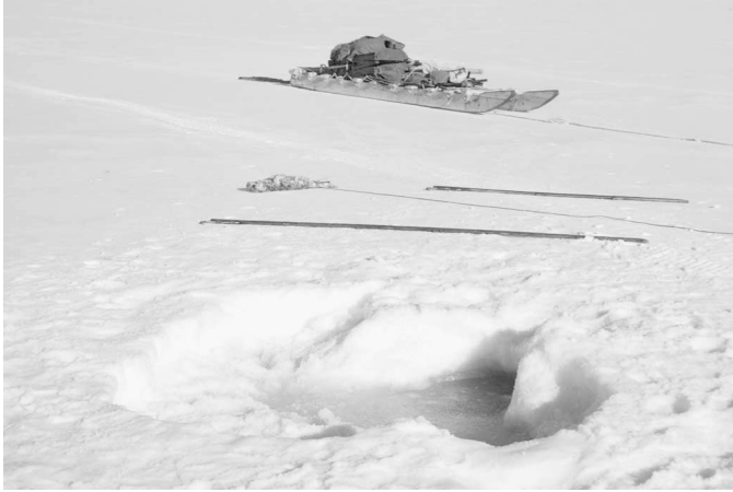
FIG. 2. A former subnivean ringed seal birth lair washed away by rain.

examined by snow machine was Cyrus Field Bay, while additional, smaller areas were located by helicopter near the north end of Rogers Island, at the southern end of Cornelius Grinnell Bay, to the east of Brevoort Island, south of Misty Island, and in the Hozier Islands (Fig. 1).