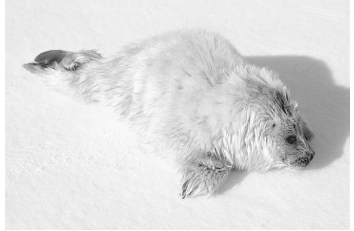
FIG. 3. A newborn ringed seal pup in white lanugo lying exposed on bare ice because its subnivean lair had been washed away by rain.

In areas where rain had washed away snowdrifts with lairs in them, the adult female ringed seals and their pups lay on the open ice (Fig. 3), exposed to the weather and in clear view of predators. Although dry pups in lanugo are probably able to maintain their body temperature in cold weather, it does not appear they can do so if wet (Taugbøl, 1984; Kelly, 2001). Ringed seal pups do not begin to enter the water on their own until they are several days old, although a female may forcibly move her pup from a lair that is being dug into by a polar bear to another lair in a complex. Prior to weaning at about 6–8 weeks of age, pups may spend up to 50% of their time in the water (Lydersen and Hammill, 1993). Thus, when temperatures fall below 0°C, continued access to birth lairs for thermoregulation is probably critical to the survival of pups in most areas, at least until they have shed most of their lanugo.